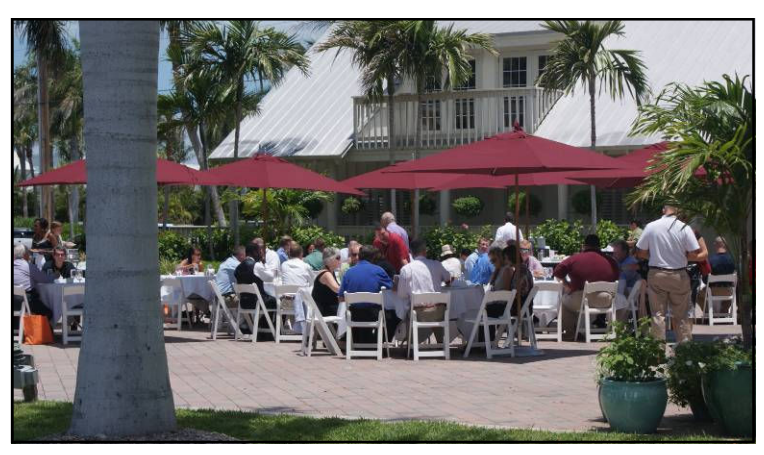
Captiva Island off the coast of Florida hosted the Florida Association for Food Protection's 2011 Annual Education Conference.

At the AEC, students have dedicated time to present their research during the poster session. Those with accepted abstracts receive travel grants to attend the conference, with related costs waived. At the 2011 FAFP Conference, we were fortunate to have six students presenting.